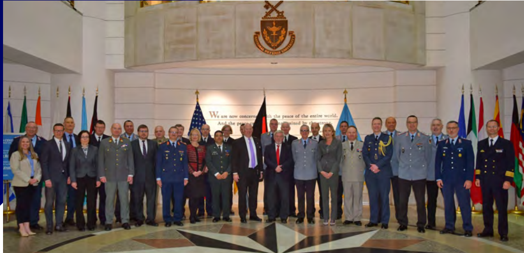
NESA and NDU faculty with participants of the German War College Higher Command Seminar