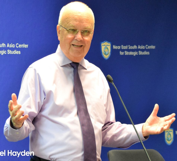
Gen. Michael Hayden