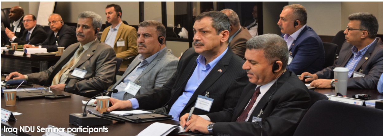
Iraq NDU Seminar participants

Throughout the seminar, the Iraqi delegation expressed their serious desire for continued cooperation with the United States, especially joint professional military education. This seminar was the first of its kind, and the NESAC Center is privileged to serve as an institutional link between the U.S. and Iraqi militaries, and support their shared objective of securing a prosperous, democratic Iraq.