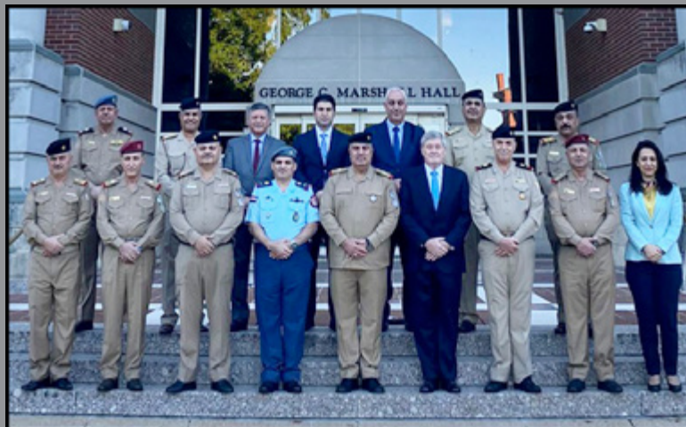
INDC Group Photo