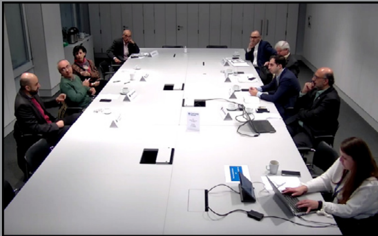
In-person meeting space during the hybrid Chatham House Workshop on February 21, 2022.