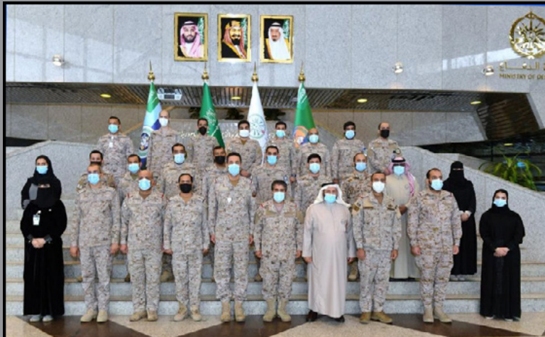
The inaugural International Humanitarian Law Diploma Program at the Armed Forces Command and Staff College within the capacity building programs at the Saudi Ministry of Defense.