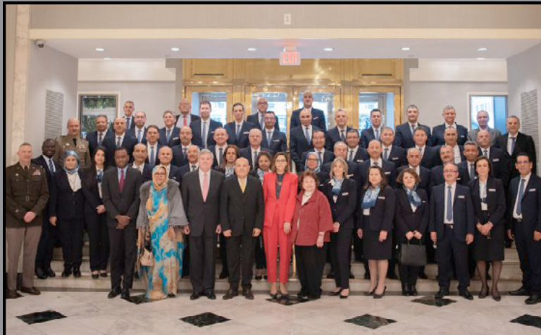
TNDI March 2022 Group Photo